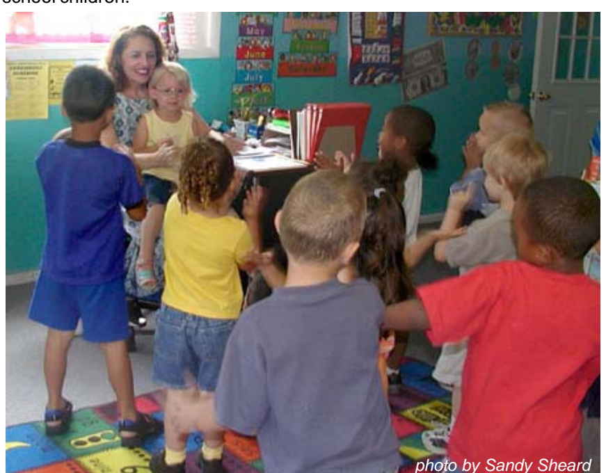
very similar to programs designed for older children.

Preschool children entering an after care program require more supervision and smaller group sizes than elementary school children, but the overall program and activities can be